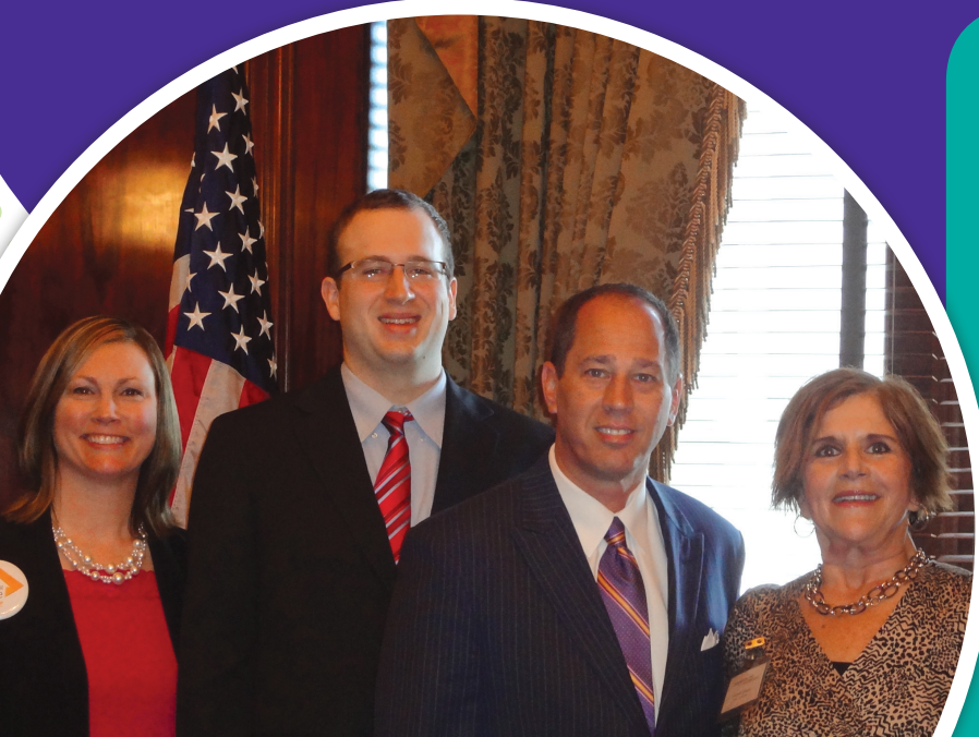
Sen. Joe Scarnati, President Pro Tempore of the Pennsylvania Senate, discusses homecare issues with PHA members

PHA is a partner to nearly 700 homecare and hospice providers who bring care into the homes of thousands of Pennsylvanians each day. Our members provide medical care, such as nursing and wound care, and physical, speech or occupational therapy, personal care, such as assistance with activities of daily living like bathing and meal preparation, and end-of-life care for those with terminal illnesses.