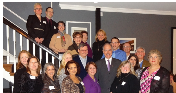
U.S. Sen. Bob Casey discusses home health and hospice issues with PHA members in Washington D.C.

With grassroots momentum, our association advocates to ensure that all Pennsylvanians, from seniors to adults with disabilities to children with complex medical conditions, are able to remain at home and in their communities.