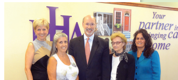
Pennsylvania Governor Tom Wolf visits the PHA office for a roundtable discussion on homecare issues with members during his campaign.